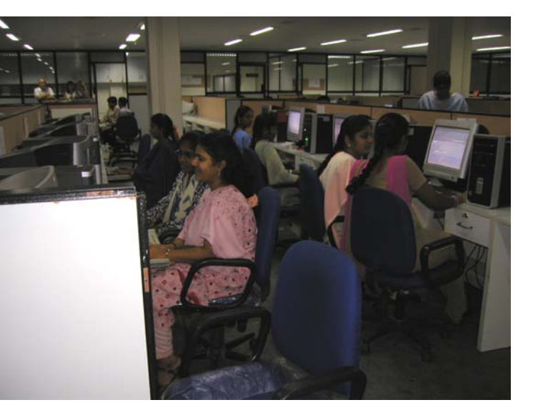
Preparing digital books for US libraries

One Indian outsourcing provider in the ECC: ITES sector is the call centre "Enhanced Customer Care. " In Chennai, in southern India, twenty young call centre agents sit at their terminals with headsets and carry out telemarketing for companies. US Speaking in American accents, they introduce themselves to potential customers in the USA as Nick, Clinton or Jasmine, and it would take a trained ear to distinguish them from American part-timers. This is the outcome "accent of an neutralising" training programme, which all agents undergo when they start. They make calls to the USA at night - using the time difference