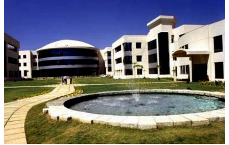
Infosys campus in Bangalore

Bangalore, at the headquarters of the IT company Infosys: futuristic buildings rise above carefully manicured lawns. Between the buildings there are goldfish ponds, and nearby a swimming pool under palm trees entices employees to a refreshing evening dip. A well-kept course awaits those who prefer golf. From outside, the corporate campus resembles a holiday resort. Shady pavilions, a covered openair canteen and billiard tables - they've thought of everything. Inside, with deadlines looming, the IT experts tinker with customer projects in air-conditioned