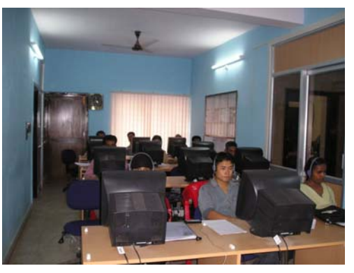
IT training lab of ITPF Bangalore

cannot sleep. It's not only a mental problem. It also has visible effects on health." In the ITES/BPO sector, output-based remuneration systems (e.g. telephone sales figures or document output) exert heavy pressure on the employees. Wherever Indian professionals have live contact with US customers, they work night shifts: a form of work that largely robs them of their personal and family lives. Some themselves see alienated from their social environment, which is all the more serious in India because individualised lifestyles are not (yet) as common as in western industrialised countries.