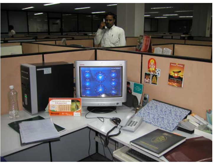
Connected to the world 24/7

electricity, tax breaks and а modern telecommunications infrastructure. In 100,000 Hyderabad alone, approximately people are employed in the IT and ITES sectors. In India, the total workforce in these sectors recently topped the 1 million mark. Wherever the export-oriented service providers set up shop, islands of prosperity form in a country known for its widespread poverty. Every new IT job creates an average of eight additional jobs, says Manoj Kumar, proudly describing the latest "Just five years ago there developments. was nothing here but rocks."